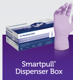
Smartpull* Dispenser Box