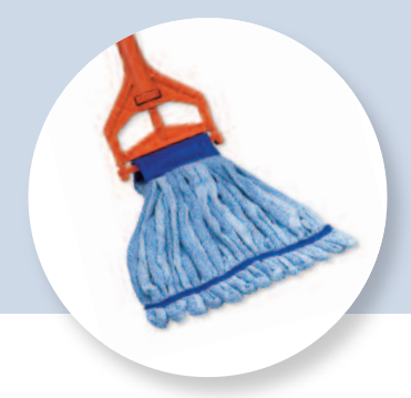
J-Zone™ MegaSorb™ Absorbent, tufted microfiber tubular looped mop for fine dry, damp or wet mopping.