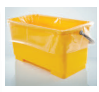
LDPE/Nylon laminate Bucket Liner in Slim T<sup>™</sup> bucket

LDPE BinLiner in Stainless Steel BinLiner Stand