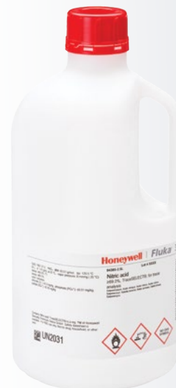
Honeywell Fluka - Nitric Acid TraceSELECT 84385-2.5L

The reduction of metals into mercury is more favourable than reduction to the solid-state electrode. Further on there is always a clean new Hg electrode surface available for each measurement.