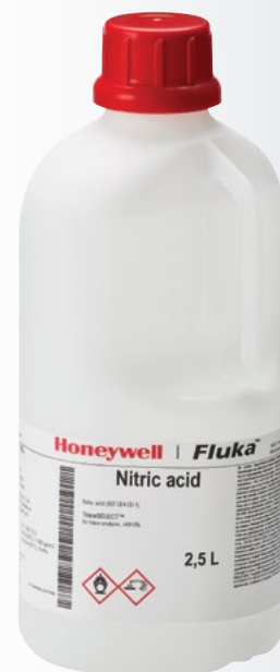
Honeywell Fluka - Nitric Acid TraceSELECT 84385-2.5L

The reagents are produced and bottled under clean-room conditions.