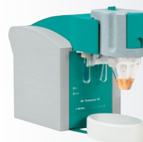
Multi-mode Electrode (MME)