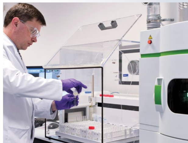
Atomic Emission Spectroscopy Analysis

With Honeywell's analytical reagents, superior quality and safety standards are a prime focus. We use a comprehensive Quality Assurance System in line with EN 29001 (ISO 9001) and each of our products is manufactured to clear, guaranteed specifications. We employ a large variety of modern analytical methods, such as inductively coupled plasma optical emission spectroscopy (ICP-OES), inductively coupled plasma mass spectrometry (ICP-MS), flame atomic absorption spectroscopy (AAS) and graphite furnace AAS (GF-AAS). This allows for specifically tailored control and analysis procedures for each product.