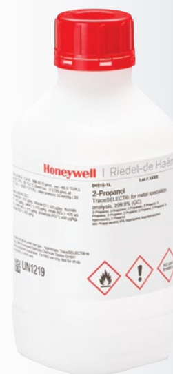
Honeywell Riedel de Haën - 2-Propanol TraceSELECT 04516-1L

The elemental response is usually independent of species, so it is often possible to quantify a species even when its structure is unknown (assuming good HPLC recovery). Identification, however, is based solely on retention time matching. Therefore, a compound in the sample can be identified only by comparison with a standard.