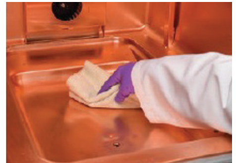
Figure 2: With shelves and cover removed, the integrated water reservoir is completely accessible for easy cleaning.